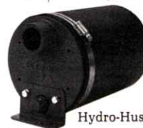
Hydro-Hush B (water lift silencer)