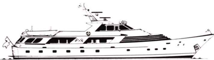
Broward 110' Raised-Bridge Motor Yacht

A small, reliable, smooth running Generator Set for all your shipboard needs; 120 volt electrical power at the turn of a switch for: Electric Cooking, Microwave Oven, Refrigeration, Cabin Appliances, Power Tools, and Navigation/Communication Equipment. Like all Westerbeke Generator Sets, it is fresh water cooled with an Engine mounted Heat Exchanger. The Engine and Generator are connected through special "Commonized" Drive Discs, Flywheel and Flywheel Housing into a compact carefully aligned Generator Set. The complete unit is mounted on lightweight rails through soft flexible Isolator Mounts that prevent the transfer of vibration. A lightweight removable Drip Tray is fitted under the unit between the mounting rails. The Engine is fitted with a Bosch Type Pump and Self Bleeding Fuel System that reduces hand priming and bleeding. Cast iron cylinder head and block plus swirl type combustion chamber plus tuned air intake silencer produce quiet running unmatched in the industry.