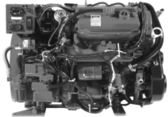
6.5 SBCG Marine Gasoline Generator

Westerbeke Safe-CO™ gensets are designed to operate in extreme ambient temperatures and incorporate a returnless fuel system to help eliminate fuel vapor-lock.