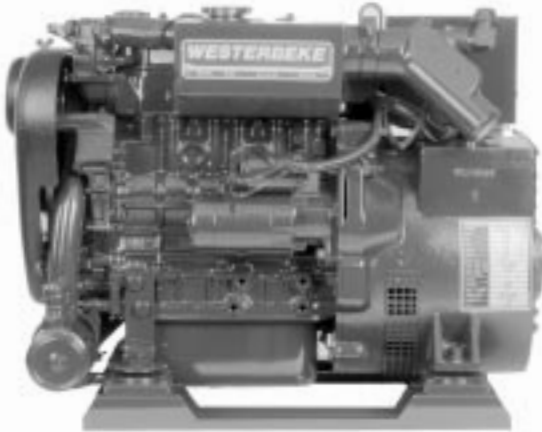
4BCD Diesel Generator