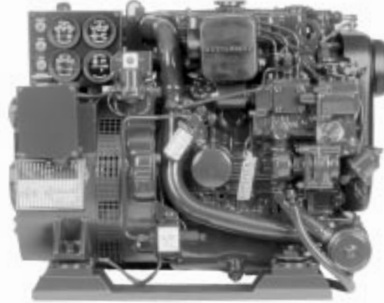
4BCD Diesel Generator