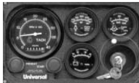
Optional Admiral Panel