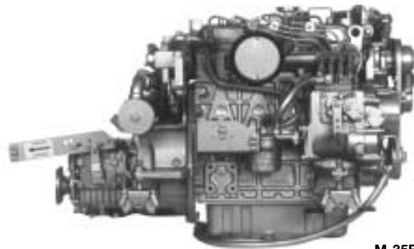
M-35B Diesel Engine

See other side for more dimension information Photographs may show optional equipment.